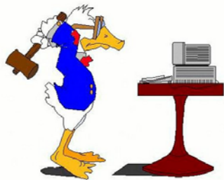
"Hit Any Key To Continue"